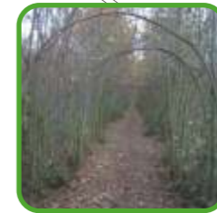
Tree lined path (Point 6)