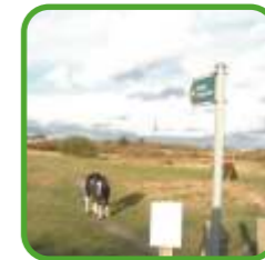
Signed path over Warmfield Common