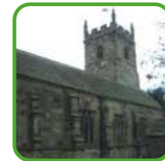
St Peter's Church (Point 7)