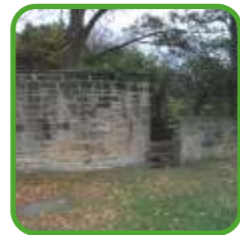
Stile onto footpath (Point 1)