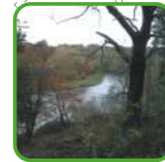
Half Moon Lake (Point 8)